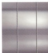
Stainless #4 (S4)