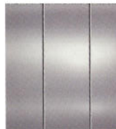
Stainless Rigidized (WL)