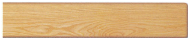
HF8 (Solid oak 2" x 8")