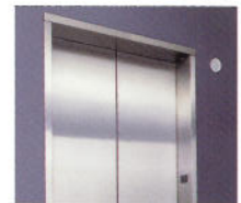
Single Speed Center Opening (CO)