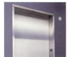
Single Speed Side Opening (SS)