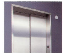
Two Speed Side Opening (2S)