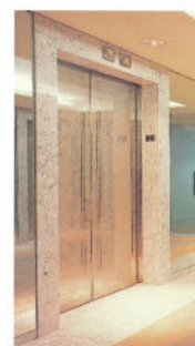
Mini frame with stone wall (by others)