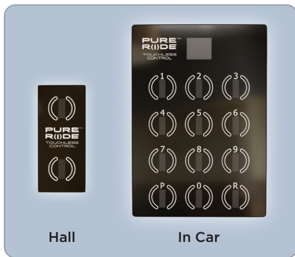
Black (surface mounted)